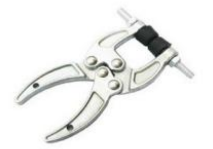
Used for assisting hair tension testing Dimension: 116*82*16MM Material: stainless steel fixture, rubber grip