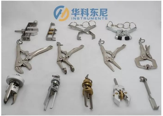
Testing Equipment for Toys and Children's products EN71 ASTM F963 ISO8124